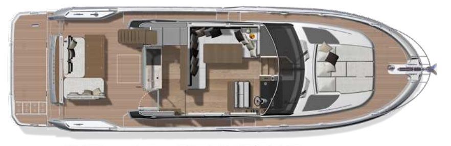
Main deck layout