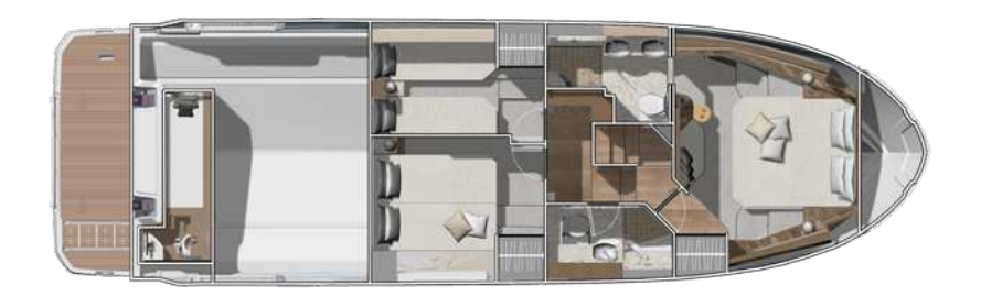
Lower deck layout