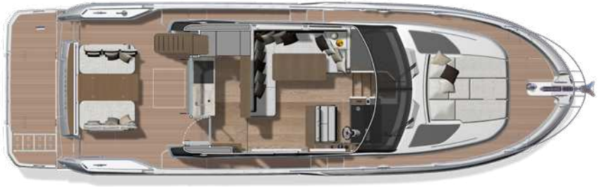
Main deck layout - facing sofa