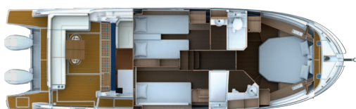
Lower deck - standard