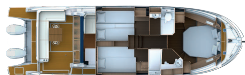
Lower deck - standard (6 berths configuration)