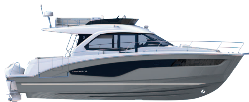
Profile pearl grey hull